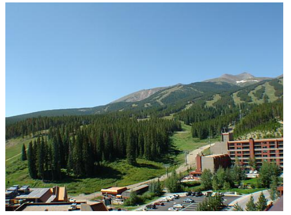
Beaver Run Resort and Conference Center

National Academy for Work Integrated Learning