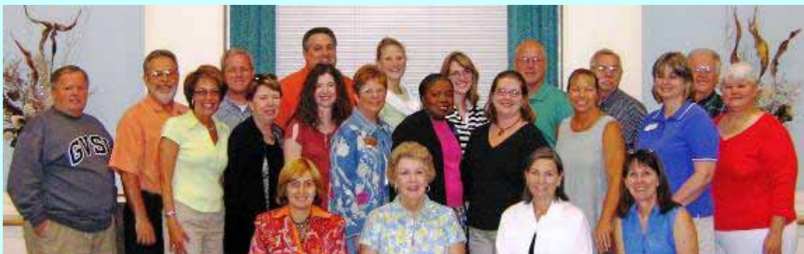
NAWIL Participants and Trainers

The "Reach Your Peak" Summer Institute has been successfully offered for 6 years and will be offered again during the summer of 2007 in two locations to be announced this fall!! Further details will appear on the Professional Development tab on http://www.ceiainc.org .