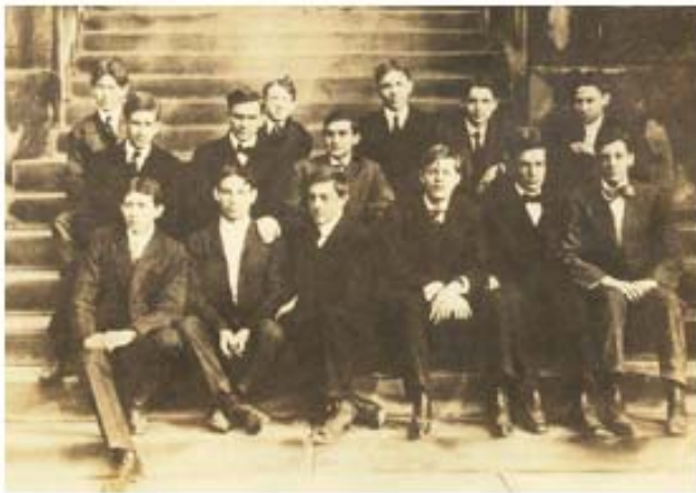
Half of the original group of co-op students

Cin'cin-nat'i plan (sĭn'sĭ-năt'ĭ; locally often -năt'ă) Educ. The co-operative plan; — originally followed in Cincinnati, Ohio. cin-cin'nus (sĭn-sĭn'ŭs), n. ; pl. -NI (-ĭ). [ L. , a curl of hair