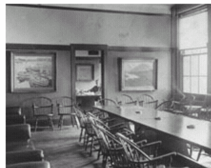
Schneider in his office

Co-op is practiced by more than 1,500 universities in 43 countries. About 500 of all colleges and universities in the U.S. now have cooperative education.