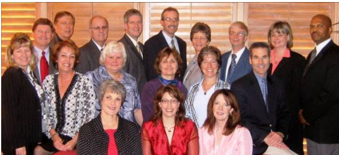
CEIA Board members at the Dallas 2007 Conference