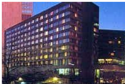
Doubletree Hotel, Downtown Nashville