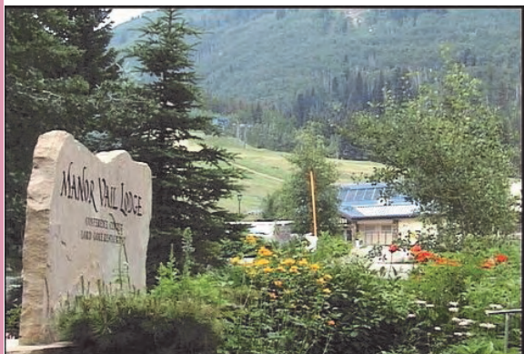
Manor Vail Lodge