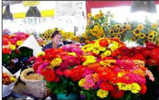
Renaissance Seattle Hotel, Washington USA