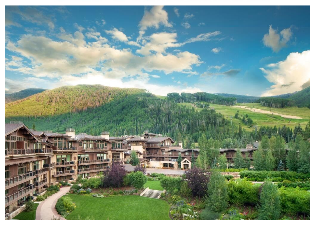
Congratulations Academy Alumni

This past week, 66 professionals attended the CEIA Academy: Virtually in Vail.